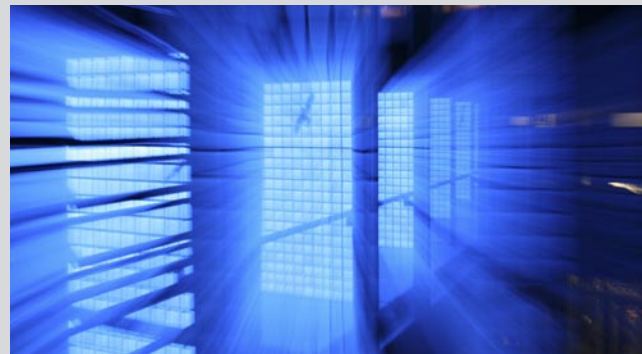
Dynamic Lighting Workshop, Summer 2008, sponsored by ElementLabs

Please register at: www.lightsymposium.de